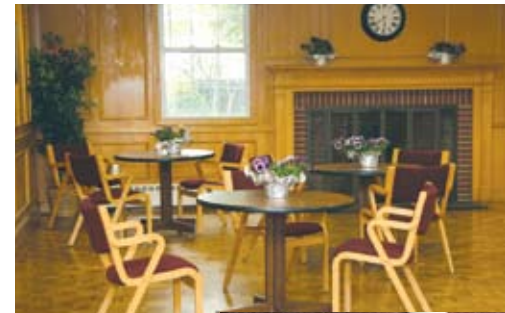
STUDENT LOUNGE, CAMPUS CENTER