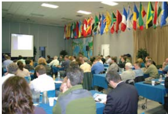
CAFÉ EAST, CAMPUS CENTER