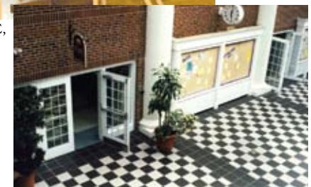
MAIN STREET, CAMPUS CENTER

Middlesex also has a campus in Lowell and owns two historic properties, The John Nesmith House in Lowell and The Middlesex Meetinghouse in Billerica, which also are available for rental. Call 976-656-3106 for details.