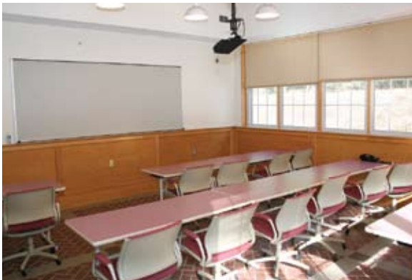
VISITOR CENTER, CONFERENCE ROOM