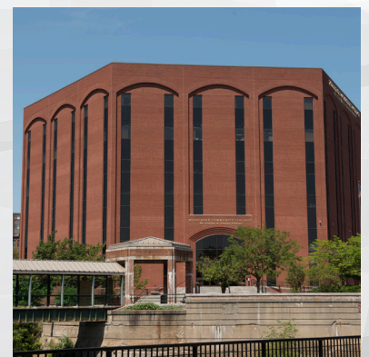
Lowell Campus 33 Kearney Square Lowell, MA 01852