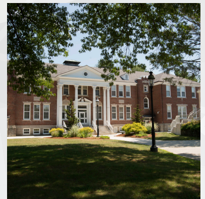
Bedford Campus 591 Springs Road Bedford, MA 01730