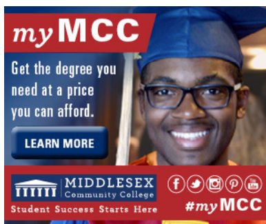
Online Tile Ad