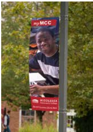
Light Post Banner

At Middlesex Community College, Student Success Starts Here! By utilizing strategic marketing communications, we continue to build awareness about the college's important role within the community. We look to the future for opportunities to further promote student access and market student success at Middlesex, and we continue to focus on the goals of increasing enrollment, maximizing student retention, and creating strategic communications.